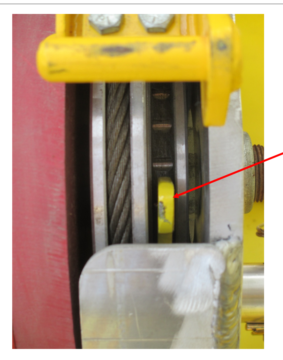
2.1.11. The override brake pad (arrow) should ride the center of the outer sheave.

2013-04-02 Page 9 of 9 Rev 1.01 MEBSP_1.1