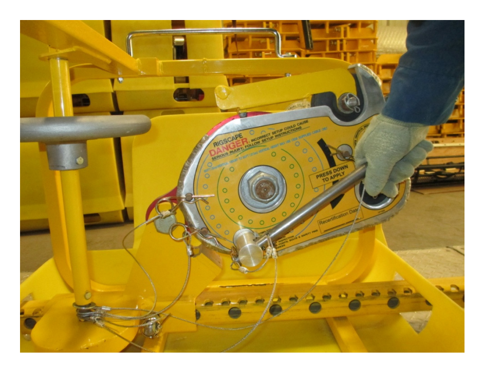
2.1.10. Apply pressure on the handle as in the direction indicated on the Magnegress cover.

2.1.9. This is a view of the assembled override-brake with handle installed.